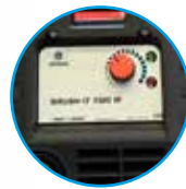
BRUSH IT without marking function