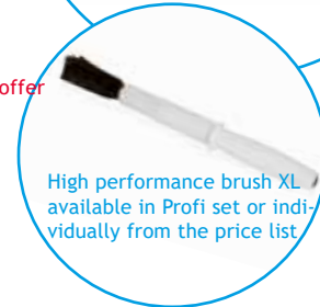
High performance brush XL available in Profi set or individually from the price list

In addition to the Brush-IT we offer our high performance brush XL with 1.4 million fibers.