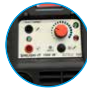
BRUSH IT with marking function