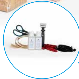
with marking set