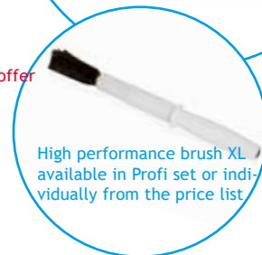
High performance brush XL available in Profi set or individually from the price list

In addition to the Brush-IT we offer our high performance brush XL with 1.4 million fibers.