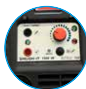
BRUSH IT with marking function