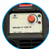
BRUSH IT without marking function